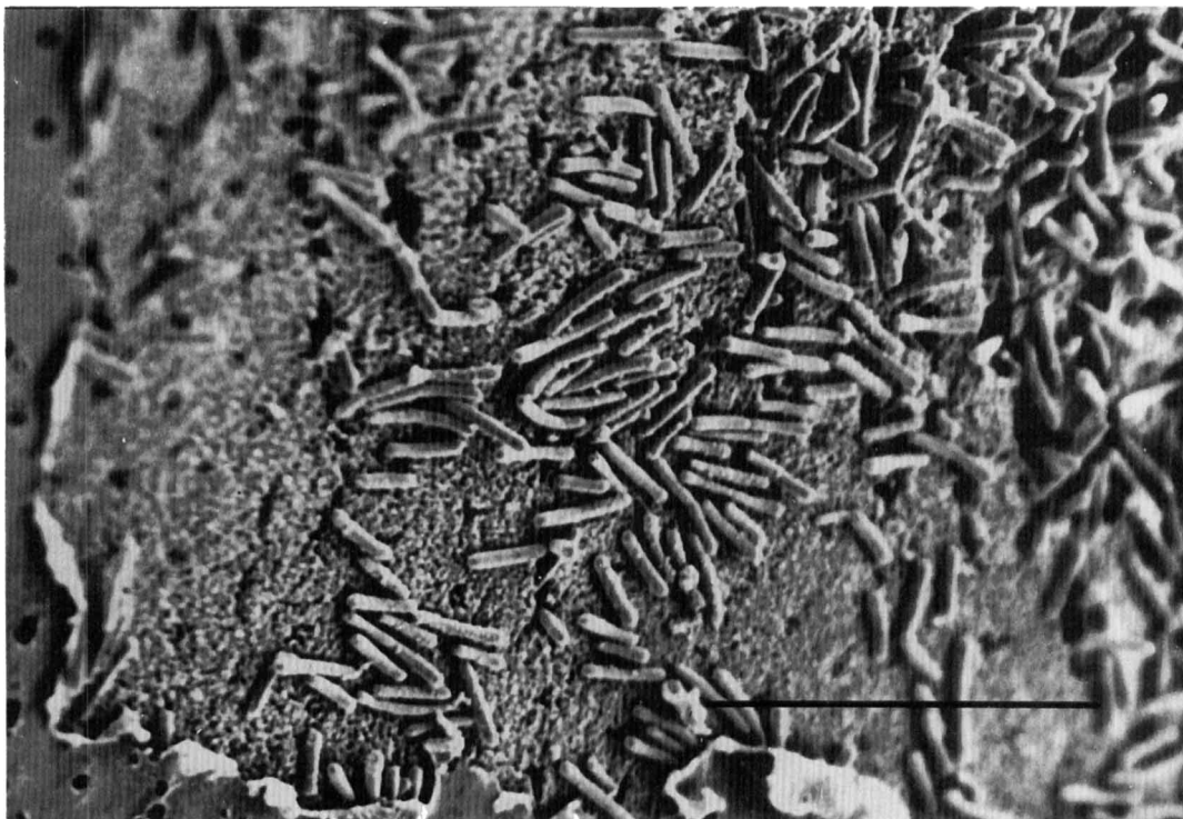
FIG. 2. Scanning electron microscopy of the surface of a F. ovolyticus -infected halibut egg. The chorion was dissolved by bacterial exoenzymatic activity, and the bacteria attacked the underlying zona radiata. The micrograph shows the edge of a wound, with undamaged egg surface to the left and severe attack on the zona radiata to the right. Bar = 10 \mu m.

That this decision is appropriate is shown by the DNA-DNA hybridization results, which revealed close relationships among the three F. ovolyticus strains examined (91.5 to 96.7%) (Table 4). Levels of relatedness of 40.4 to 42.9 and 26.4 to 30.3% between F. ovolyticus and F. maritimus NCMB 2154 T and NCMB 2153, respectively, qualify these organisms for positions in different species (28). The differences in sodium dodecyl sulfate-polyacrylamide gel electrophoresis patterns between the two egg isolates (strains EKC001 and EKD002 T ) and the water isolate (strain VKB004) (Fig. 1) may reflect differences in protein expression. The divergent characteristics of strain VKB004 are underlined by its somewhat higher G+C content (Table 1) and its levels of DNA relatedness (about 90%) with strains EKC001 and EKD002 T , which were related to each other at