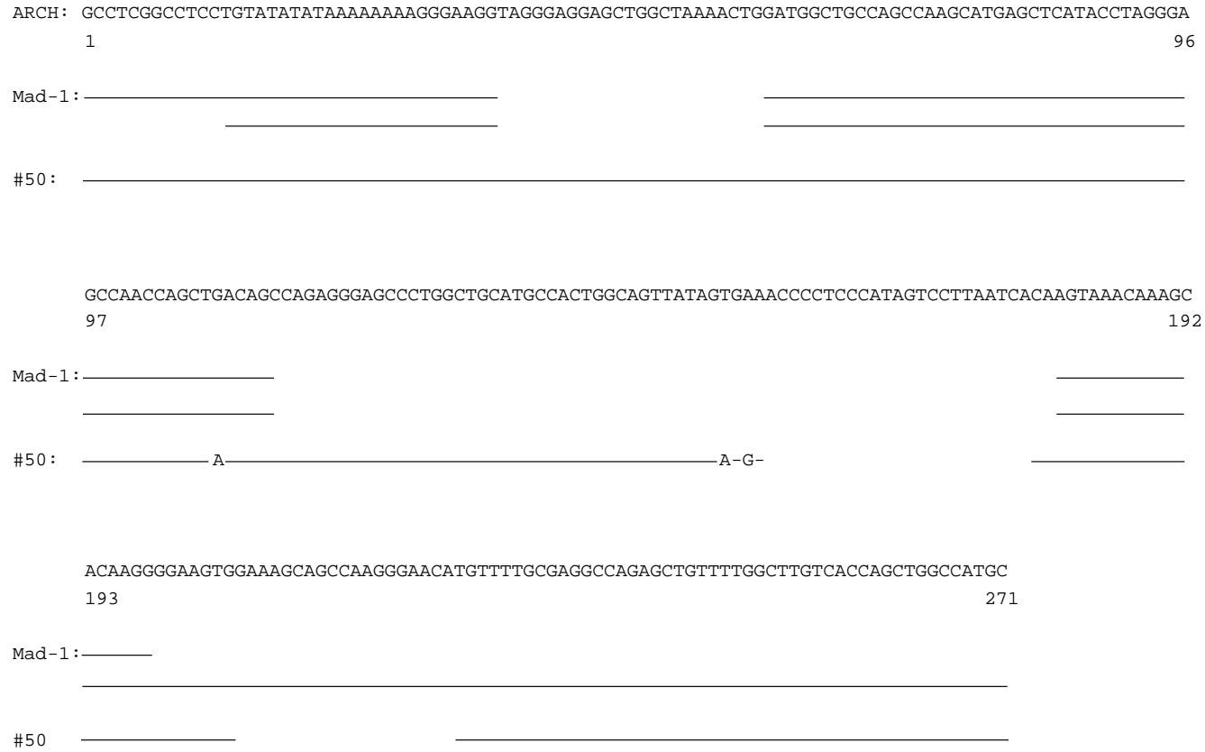
Fig. 2. Alignment of JCV Mad-1 strain (middle) and CSF sample 50 (bottom) DNA sequences with archetype sequence (top) between the origin of replication (at nucleotide 1 in genome map) and the late ATG codon. Full lines indicate identity with the archetype sequence, gaps are deletions relative to archetype, repeats begin on the next line. Nucleotide substitutions in sample 50, compared with archetype sequence, are indicated with capital letters.